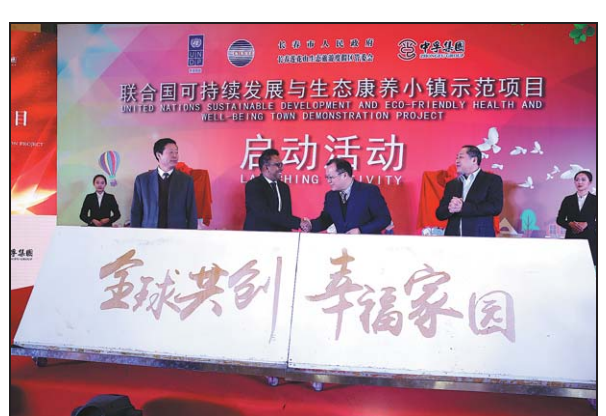
Representatives from the local government and the United Nations Development Programme launch a demonstration project for sustainable development in Changchun, Jilin province, on Jan 29.

ellness center. According to the National Bureau